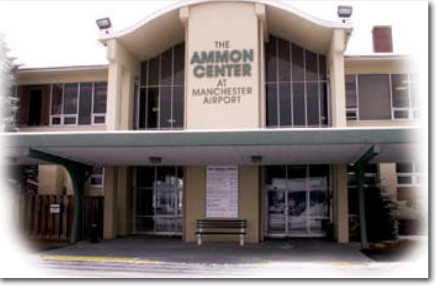
The Ammon Center • Manchester, NH